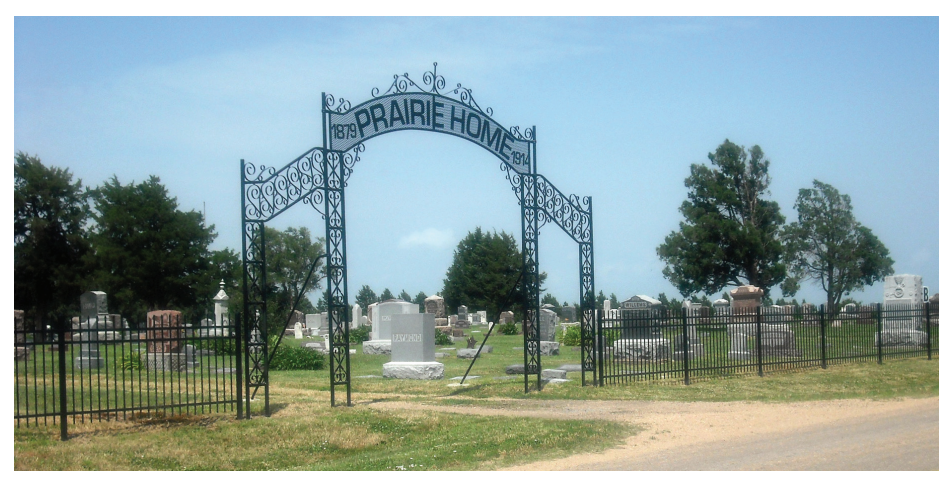
A beautiful new fence has been constructed around the Prairie Home Cemetery. Additional funds are needed to complete the project.